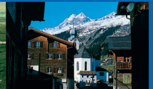
Brigels / GR

FOR THE 75 TH ANNIVERSARY OF THE «GLACIER EXPRESS»