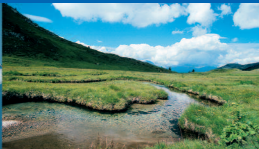
Réchy / VS