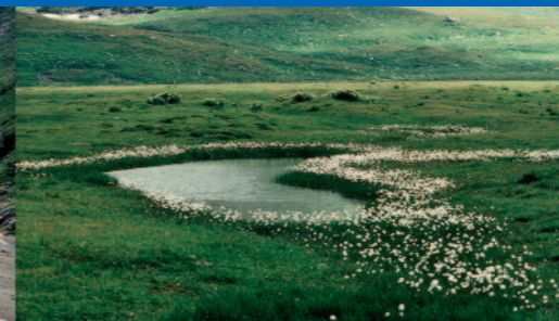
Greina / GR