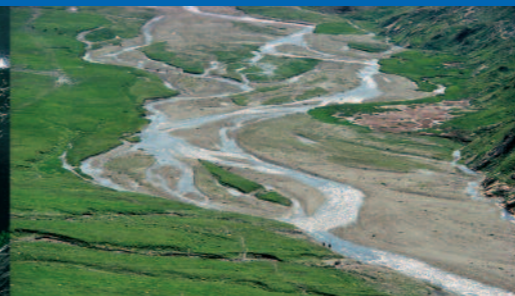
Greina / GR