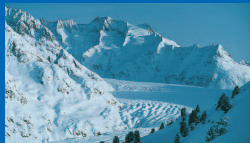
UNESCO W.N.E / VS